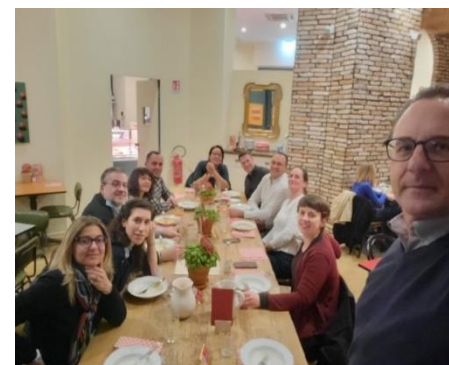
One of the moments of the meeting in Milan